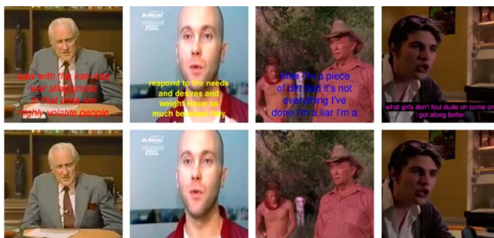
Removing captions from videos