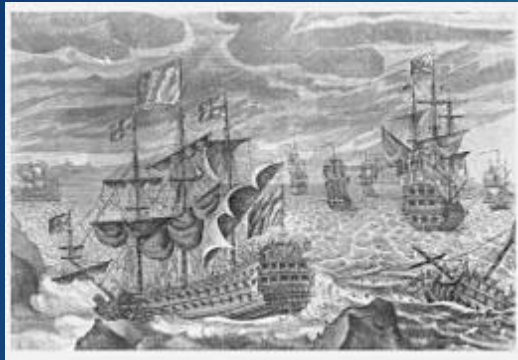
Longitude Prize, 1714